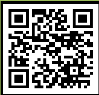
Please scan for direction to the centre