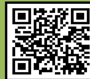
Please scan for programme of activities